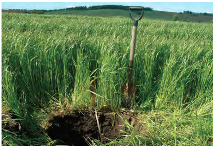
Annual ryegrass adds forage value and is an excellent spring ground cover.