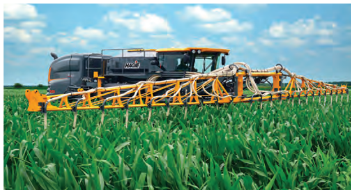
Seeding annual ryegrass into standing corn with an interseeder.

No-till drilling provides good seed-to-soil contact and is a dependable method to establish an annual ryegrass cover crop. The seed should be planted at a rate of 12-15 lb/a at a depth of ¼” to ½”. Another method that can be used is broadcast seeding, using a higher seeding rate of 20-25 lb/a. Experienced growers in