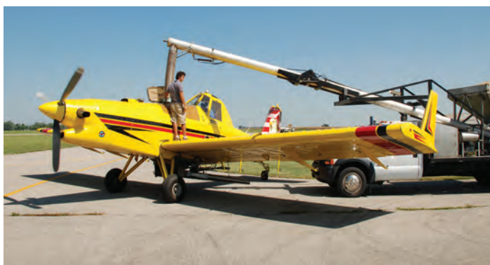
Loading annual ryegrass seed for aerial seeding.

A variation of the airflow broadcast seeding method is the use of a fan spreader buggy or truck. Annual ryegrass weighs only 26 lb/bu and will not spread as far as fertilizer. Fan spreaders require that everything be applied at half the rate and double spread to ensure that the ryegrass seed is uniformly distributed. Mixing a quart of crop oil with the fertilizer and annual ryegrass helps the seed stick to the fertilizer and improve spread pattern.